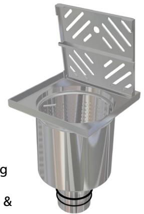
Exploded View showing removable Grate, Basket & Fixed Strainer